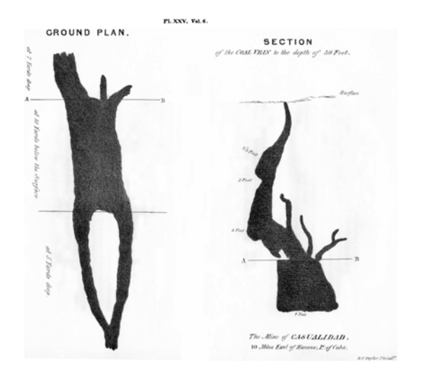
Figure 10.2: Plan of the coal deposit (Taylor and Clemson 1839).

The foregoing examination of this bituminous coal, fixes definitively the respective proportions of its component parts; consequently, it determines the applications to which that combustible would be the best adapted. Its quality of burning with a long, licking flame, gives it many advantages for evaporating, heating surfaces, &c., over many combustibles, which contain smaller quantities of volatile matter. For the generating of steam power, for the boiling or concentrating, the juice of the sugar cane, or for the manufacture of gas, this coal is singularly well adapted. As it contains no sulphuret of iron, the gas manufactured would be free from that very deleterious portion or admixture, which it is so difficult to separate from those gases usually manufactured from bituminous coals containing sulphur. It might also be employed with advantage in manufacturing lamp black (noir de fumée). (Taylor and Clemson 1839, 195)