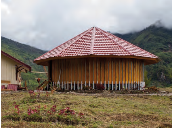
Figure 18.7: “Center Budaya,” the Cultural Center Eipomek, built with German and Indonesian funds. It houses a large collection of photographs, films, and publications documenting traditional life and customs before the Eipo decided to become Christians around 1980 and serves as a way to “preserve our roots,” as the Eipo say. They are proud of this institution in their valley; other museums devoted to the history and culture of Papuan peoples are restricted to the urban regions.