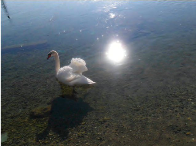
Figure 18.9: ...and the swans of Lake Starnberg. More than 30 young people have successfully finished university education—their parents still lived an isolated neolithic life. A dramatic change.