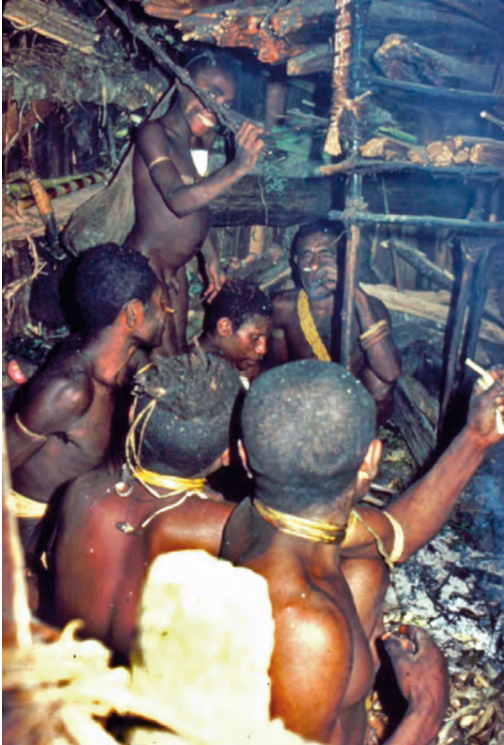
Figure 18.2: Coming together after a day's work in the gardens and the rain forest. The family huts of the Eipo were very small, preserving the warmth of the fire place in the cold nights. A hafted stone adze is placed at the left wall.