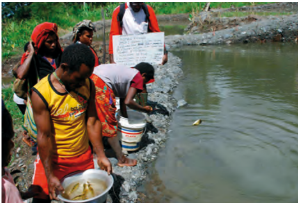
Figure 18.6: Breeding fish in specially constructed ponds has become a sign of high status; formerly, no fish lived in the fast flowing rivers of the central highlands. For the quickly growing population, carp and tilapia provide valuable protein. The owners get cash income from this new economic activity and sometimes export fish (in buckets transported by airplane) to other areas.