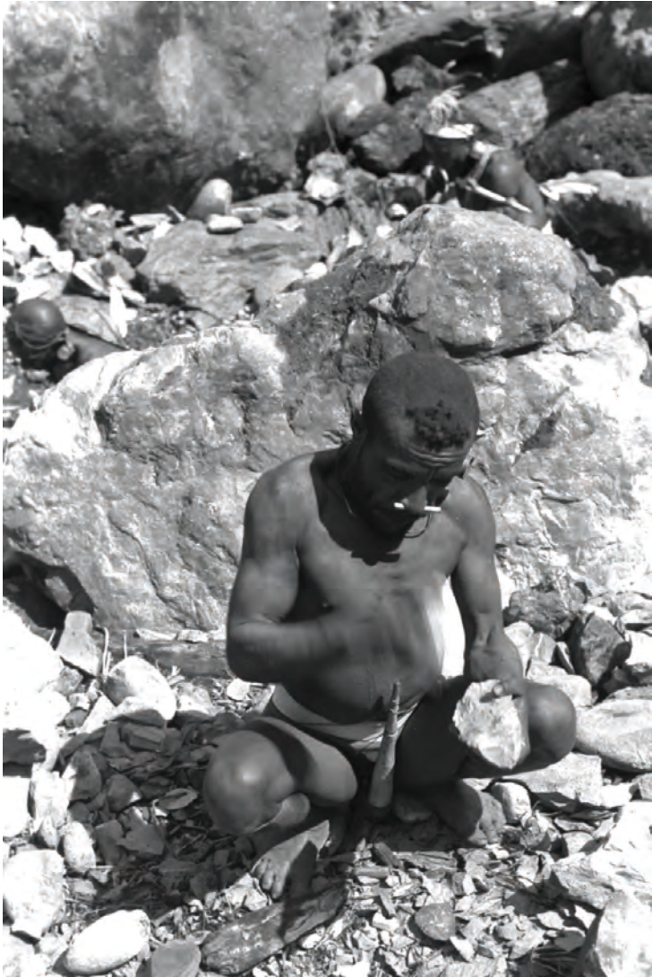
Figure 18.1: Prehistory lasting into the present: A man from Larye, a Mek language area, knapping, with amazing professionalism, a block of Andesit rock into a stone adze blade. Even today (2018) this technique is in practice because stone adzes are often part of bride price and other ritual payments.