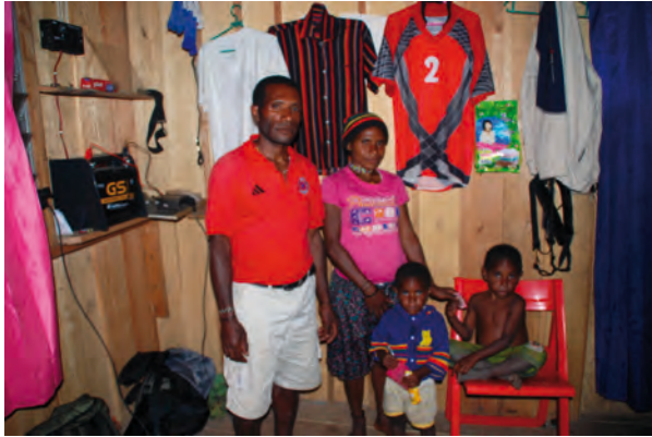
Figure 18.3: An Eipo family in their modern house, provided by the government. The battery on the left is connected to a solar power system providing electricity for lighting and CD players. As these houses have no fire place (the design is borrowed from Sulawesi), the Eipo cook and eat dinner in traditional huts, where they also sleep in the night, cuddled around glowing embers.