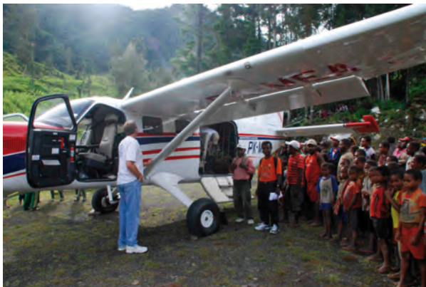
Figure 18.4: Single engine airplanes are the only means of transport to the urban centers at the coast, 200 km direct line away. This is the third airstrip the Eipo have built in 40 years. It is 550 m long at a 5% slope and enables larger aircraft than the usual Cessna and Pilatus Porter to land: competition with other valleys.